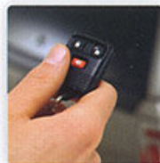
Secure remote lock.**