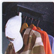
Convenient fold-down clothes hanger.