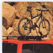
User-friendly, contractor grade rack system from Thule*