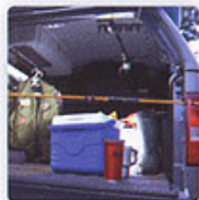
American Outdoorsmen package with overhead storage box, fishing rod holders, carpet and clothes hanger

© 2008 Century Truck Caps, a division of the Truck Accessories Group, LLC. | A leading manufacturer of quality truck caps and tonneau covers | Proudly made in the USA | 800.828.2277 SEE YOUR LOCAL &Roovy CENTURY DEALER