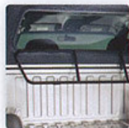
Easy-to-clean fold-down front window.

ACCESSORIES. Once you see it, you'll need it. *