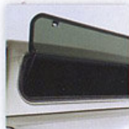
Clever side access "Win-Door" with latches and piston assist.